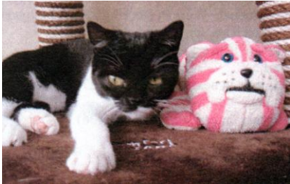
Izzey and Alfie enjoying a leisurely moment at their new home.